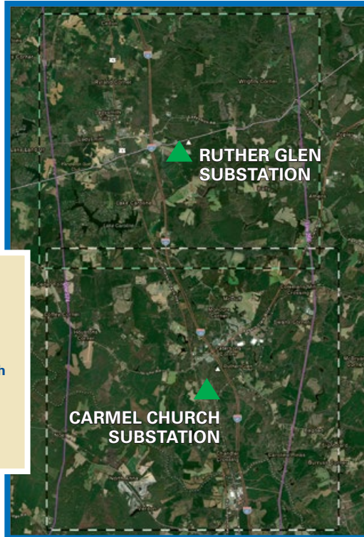
The map is intended to serve as a representation of the project area and is not intended for detailed engineering purposes.

Protecting the grid against natural and man-made acts is a top priority. You can learn more about our commitment to safety at powerlines101.dominionenergy.com .