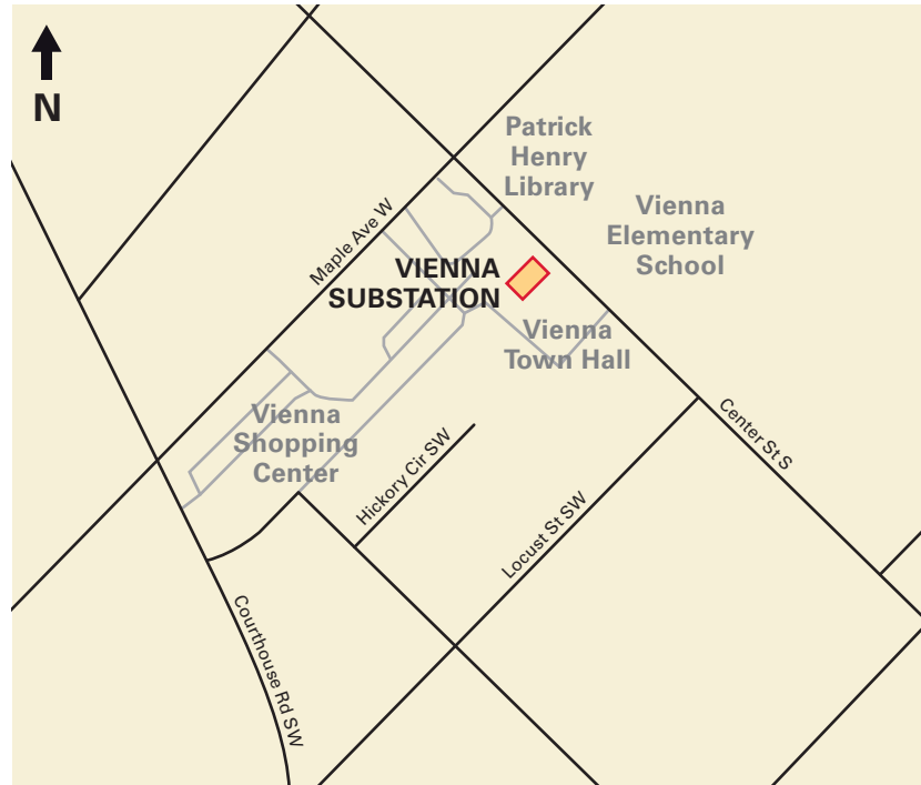
This map is intended to serve as a representation of the project area and is not intended for detailed engineering purposes.

Protecting the grid against natural and man-made acts is a top priority. You can learn more about our commitment to safety at powerlines101.dominionenergy.com .