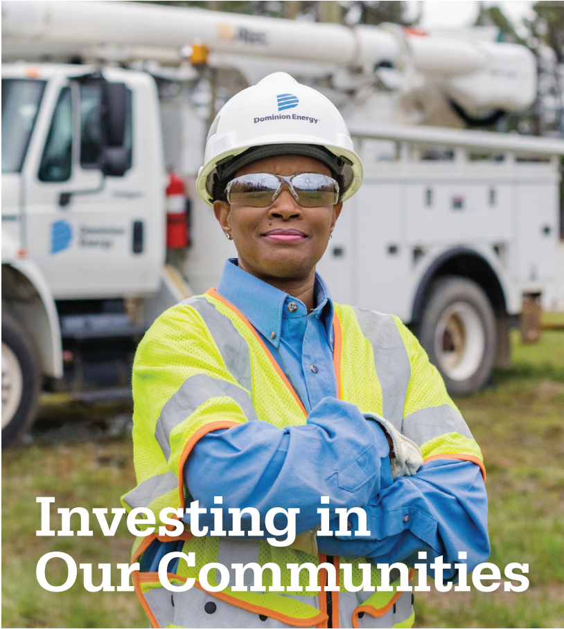
Not project specific.