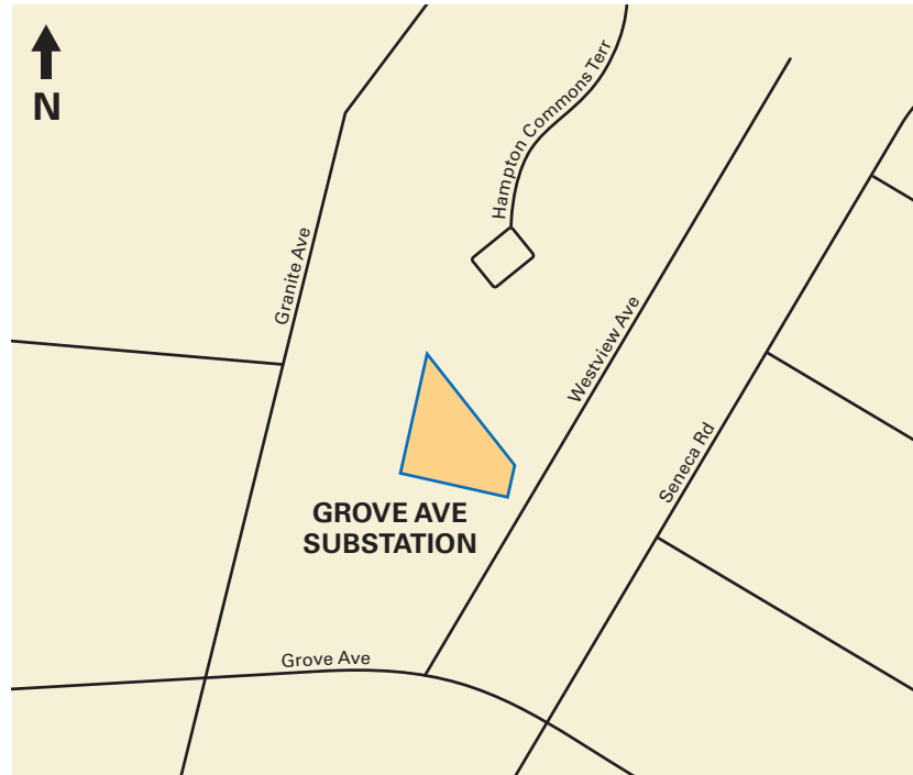
This map is intended to serve as a representation of the project area and is not intended for detailed engineering purposes.

Protecting the grid against natural and man-made acts is a top priority. You can learn more about our commitment to safety at powerlines101.dominionenergy.com .