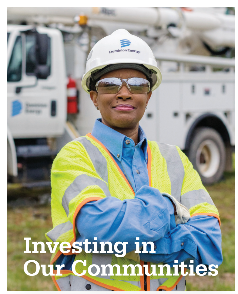
Not project specific.