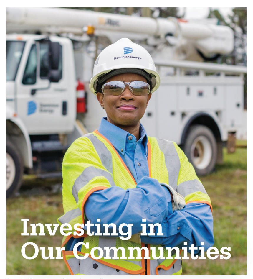
Not project specific.